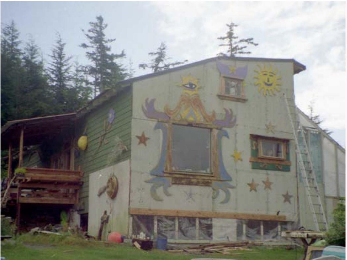
Figure 6. Unfinished temple at Cassiana Island Sitka Alaska, 1992