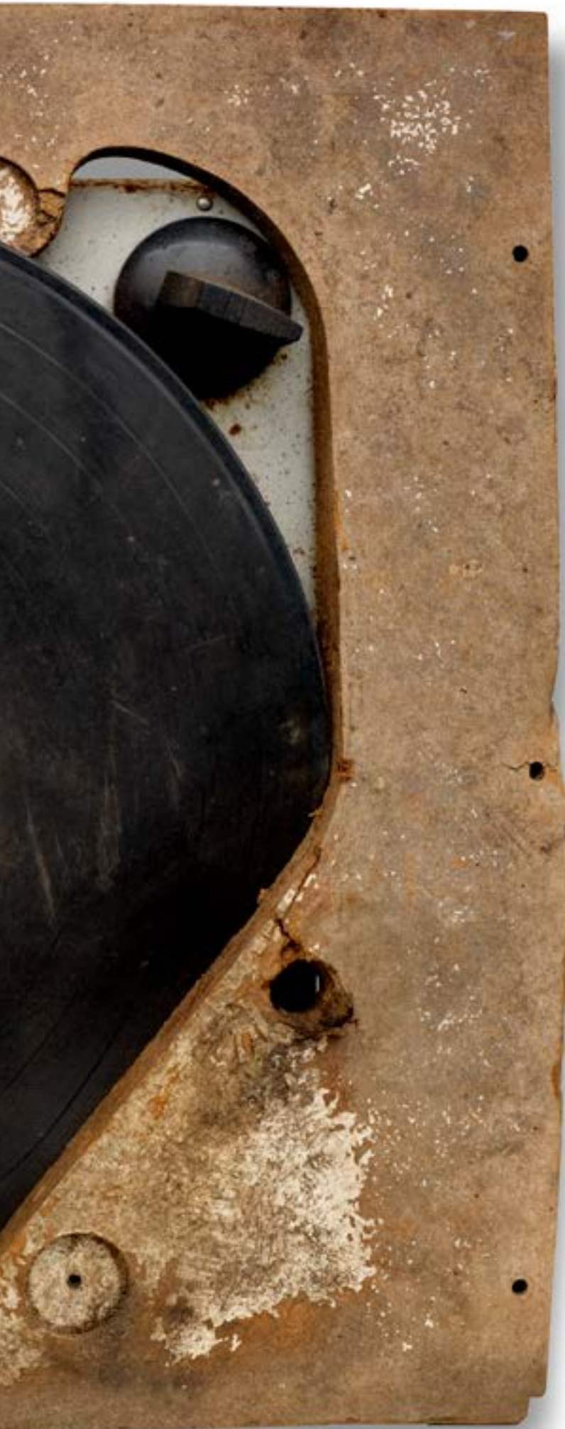
Figure 8. Lonnie Holley, Keeping A Record Of It (Harmful Music) , mixed media, 34.925 x 40.01 x 22.86 cm, Souls Grown Deep Foundation