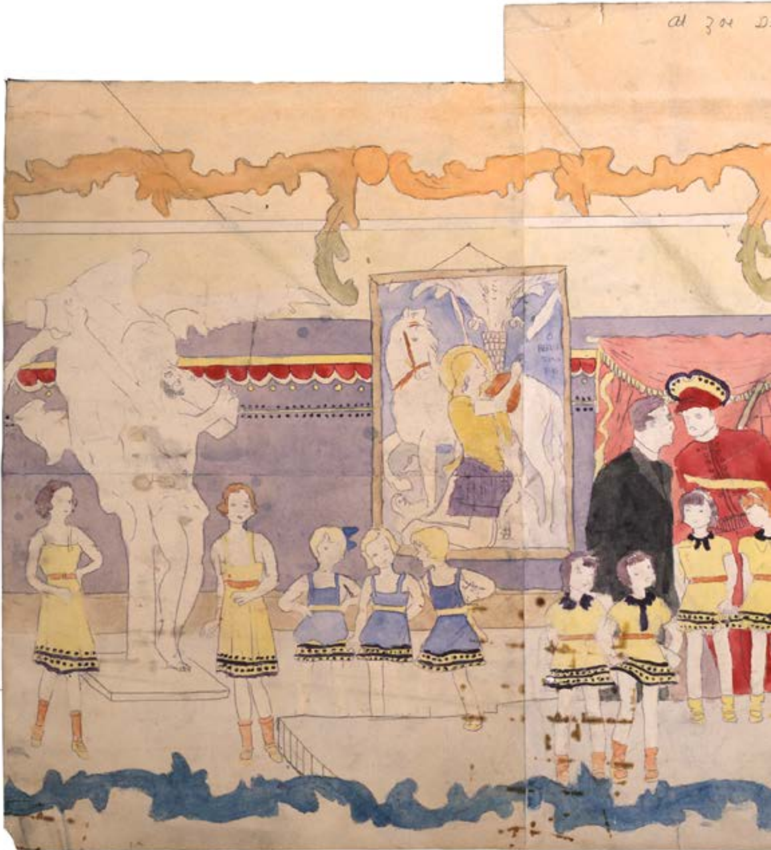
Figure 4. Henry Darger, At Zoe-Du-Rai-Beck. The result after Violet saves a priest and his sacred monsthrance from being shot , n.d., watercolour, pencil, and carbon tracing on pieced paper, 48.26 x 86.36 cm, Private Collection, Belgium, Courtesy of Andrew Edlin Gallery, © 2014 Kiyoko Lerner / Artists Rights Society (ARS), New York Reproduction, including downloading of Henry Darger works is prohibited by copyright laws and international conventions without the express written permission of Artists Rights Society (ARS), New York