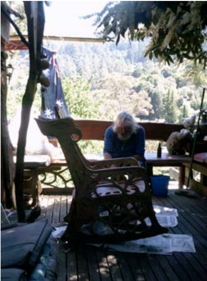
Figure 15. Boinga Bob's carved chair, November, 2013

Undoubtedly, I wanted the temple to be the way I remembered it and this was not possible. I remember Bob when he was residing in the original temple and working on his PhD. I was there when the original temple burnt to the ground and I was there for the start of the new building, but I had not accounted for a dramatic shift in building style or the transformation in the man, albeit I must have witnessed some of it. When people struggle and grow older in one's absence it is as though a sudden weakness and decay has set in overnight. Changing and growing older is always reflected in others, we never seem to see it in ourselves. The encounter with Bob's new temple aroused mixed feelings, the cruelty of aging, the impermanence of life, the constant struggle to hold back nature, the lack of freedom to express inner thoughts and crisis. I would carry these feelings into the task of writing. Hence, undertaking this account has turned out to be a very cathartic experience.