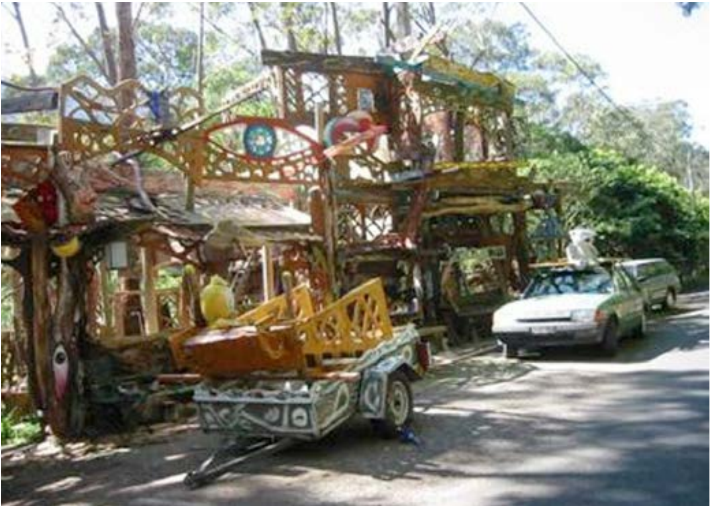
Figure 14. Painted trailer and car outside the temple entrance, July 2012

It would appear that imagining a colour can invoke a stronger hue than looking at the real colour. Also, the blurring of senses can improve memory, shape, texture and colour as well as the use of metaphor: