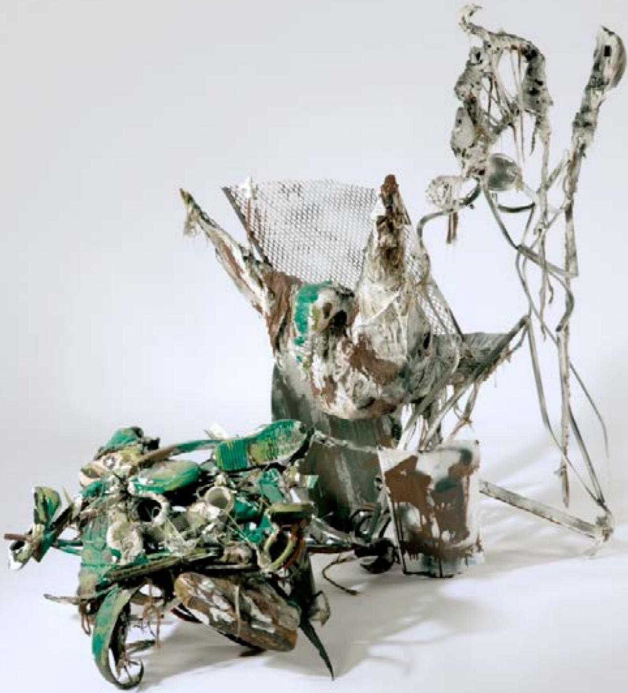
Figure 2. Thornton Dial, Walking with the Pickup Bird , 2002, steel, twine, cloth, shoes, crockery, auto tire scrap, enamel, spray paint, and Splash Zone compound, 134.62 x 157.46 x 91.44 cm, Collection of Ackland Museum of Art