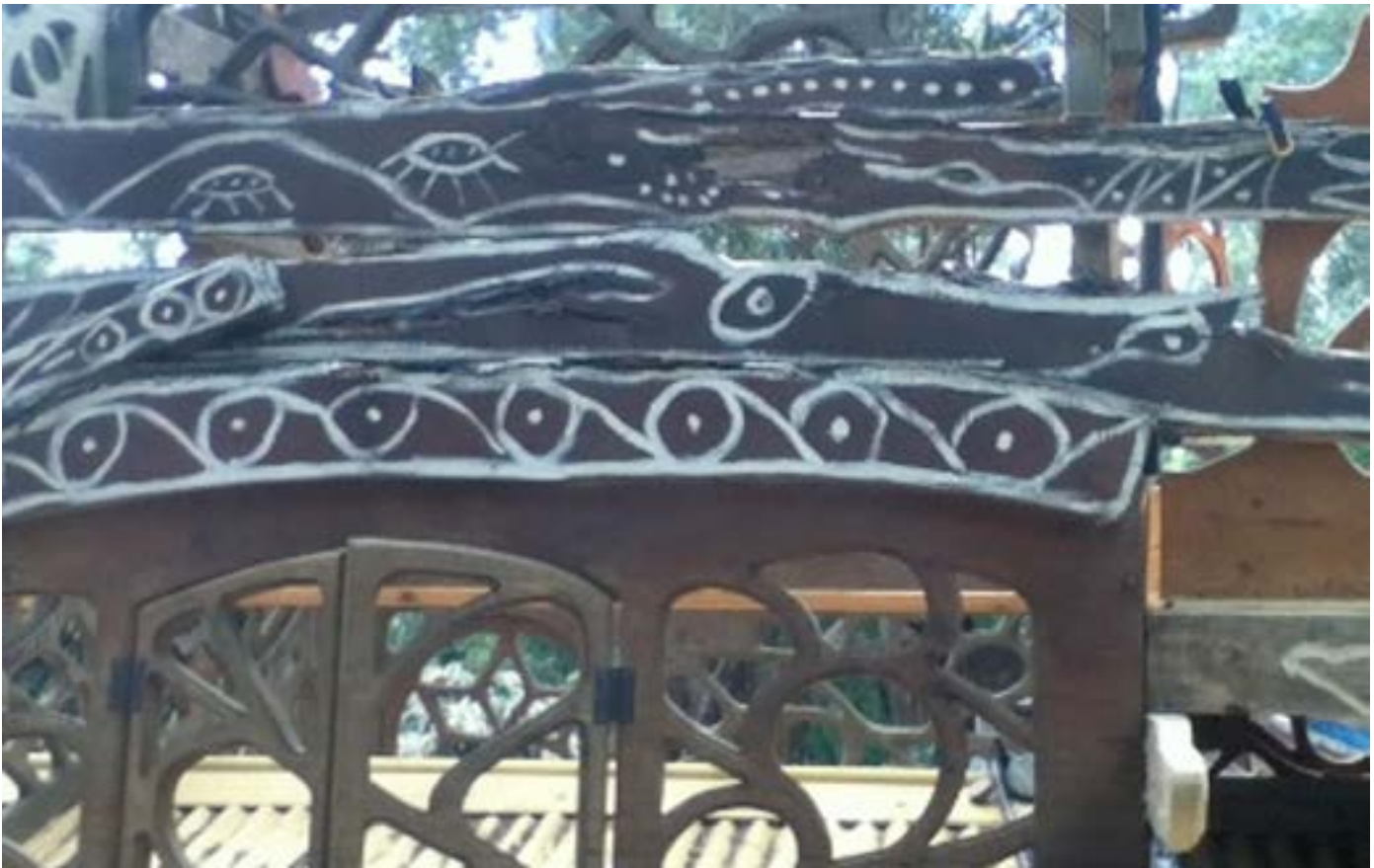
Figure 7. A temple tower under construction, November 2011

to the ground. It happened at night amidst a bevy of helpless onlookers. The community was in shock. I accompanied Bob when he returned to Warburton to inspect the fire site. He was stoical, but the pain cut across the rigid lines on his forehead and spread to the tightness of his mouth. He fought back tears as he stood before the rubble with folded arms locked tightly across his batik shirt and sandalwood necklace. The temple was gone except for the remaining foundations, which looked like a charred sacrificial altar. There seemed to be no recompense.