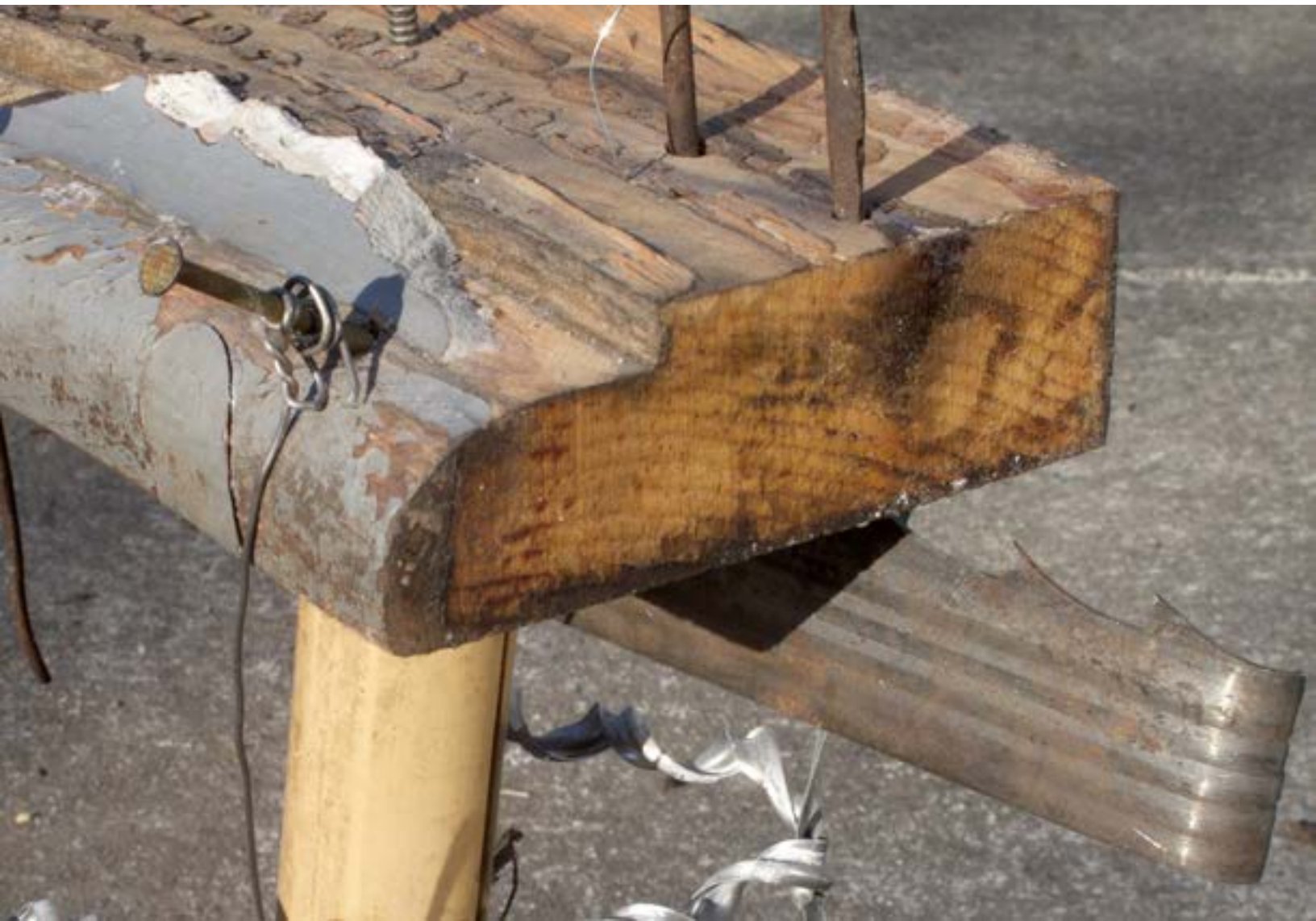
Opposite: Figure 3. Lonnie Holley, Rusted Nail , 2009, mixed media including bamboo, found wood, rock, wire, and metal, 64.135 x 30.48 x 19.05 cm, Private Collection Above: Figure 4. Rusted Nail , 2009, detail with the “saw blade” and upper portion of the bamboo upright that serves as scaffold and armature for the larger work