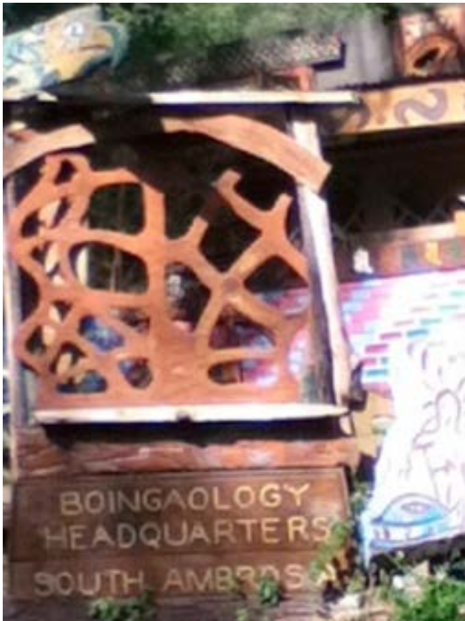
Figure 2. The sign outside Boinga Bob's temple, June 2012

At first glance it instills the idea of utopia and perhaps a cult. It is not a cult, but it is clearly a different cultural domain that juggles tradition with deconstruction and the postmodern mix of mainstream aesthetics and esoteric ideologies.