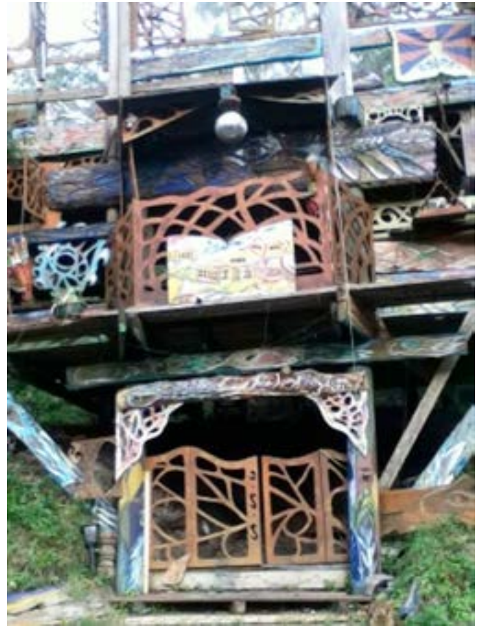
Left: Figure 8. The Tree House , December, 2011 (photograph Robert Prudhoe) Right: Figure 9. The annex (unfinished) , July 2012 (photograph Robert Prudhoe)

There was no longer a socially accepted form of order and there was no end in sight. This new, intriguing period in Bob's work was unfortunately destined to widen the chasm between what the mainstream authorities viewed as 'real' art and the spontaneous, intuitive, creations of outsider art (figure 10).