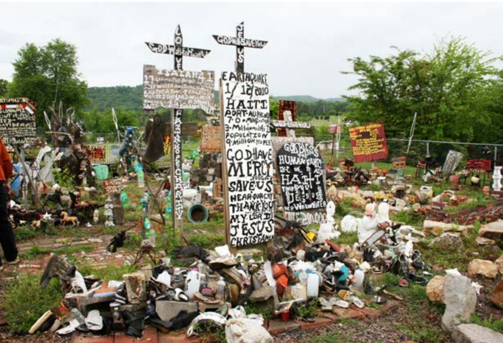
Figure 1. Joe Minter, 'Haitian Earthquake', African Village in America , Birmingham, Alabama (photograph Colin Rhodes, April 2012)