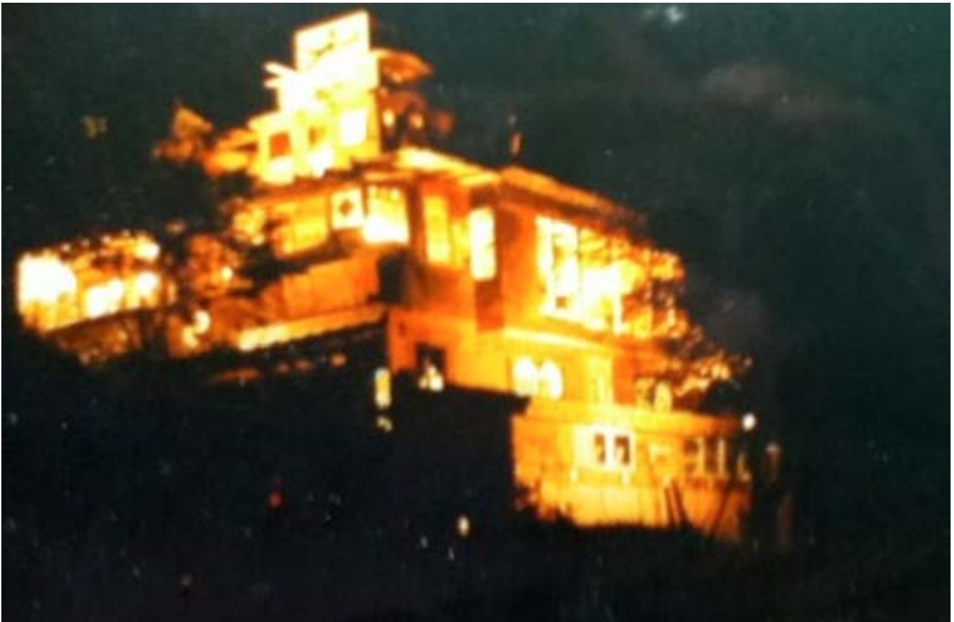
Figure 3. Night time view of the original Boingaology Headquarters , 1982

Day or night the sound of Ram Das and Tibetan chimes rang out across the township. Buffeted by the forested slopes on all sides, the music spiralled and reverberated across the landscape like a celestial choir. In the area immediately surrounding the temple the air was permeated with Asra Om Nag Champa incense. The building stood magnanimous amidst its many installations, such as old stone carvings, ornamental plaques, stained glass windows and prayer wheels. Its large carved wooden doors were breathtaking. On the inside it resembled a rich Tibetan home and it was very neat and tidy. Boinga Bob was meticulous about his environment (figure 4).