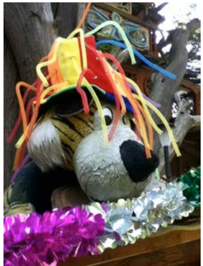
Left: Figure 11. Painted vinyl chair and metal cabinet, June 2012 Right: Figure 12. One of the temple toys, December 2011