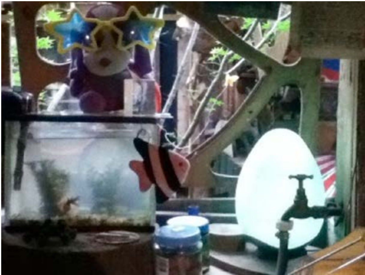
Figure 10. Everyday objects mingled with carvings, November 2011