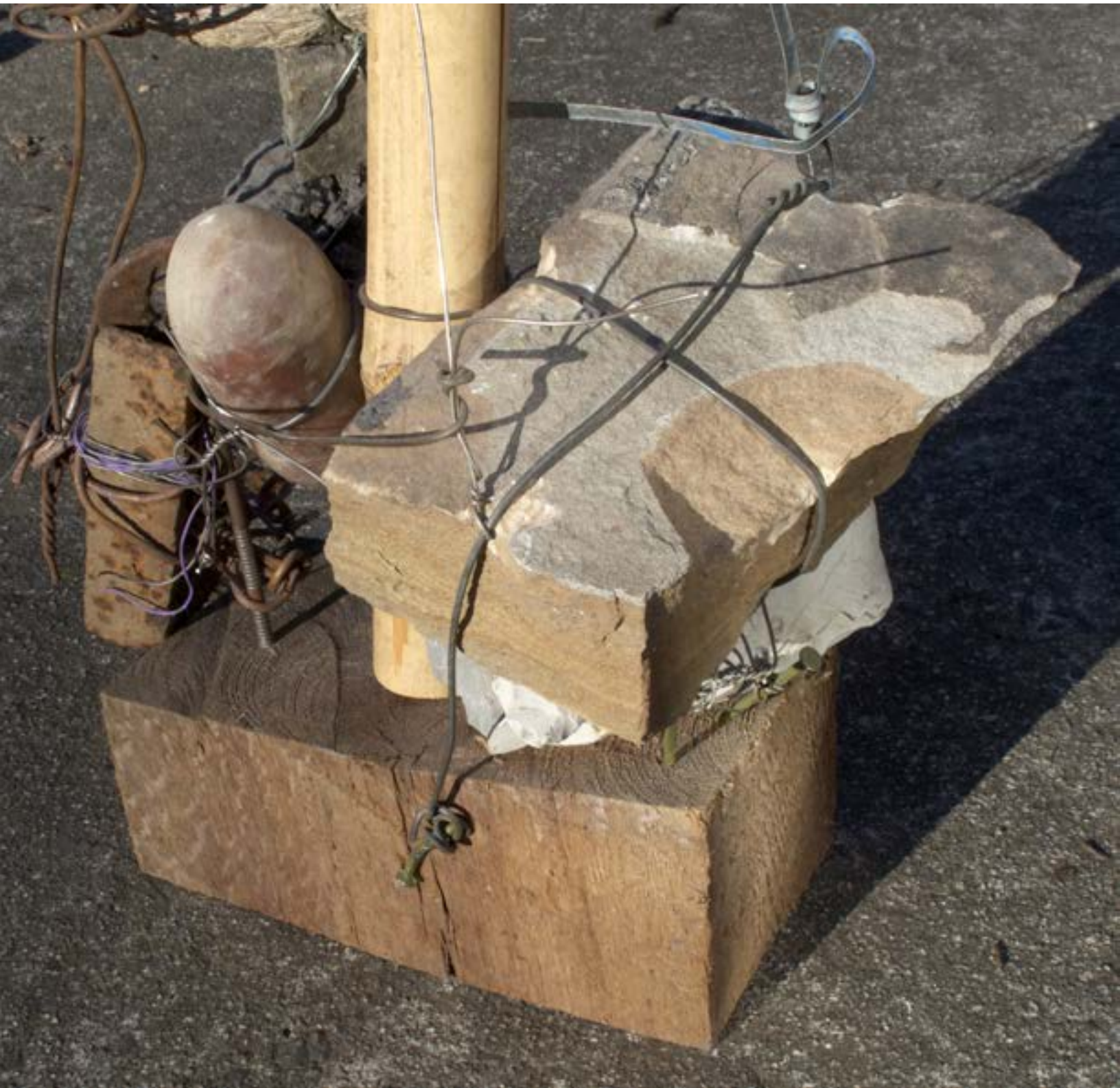
Figure 5. Lonnie Holley, Rusted Nail , 2009, detail depicting the “grandmamma gravel” and the debris washed around the levee’s base