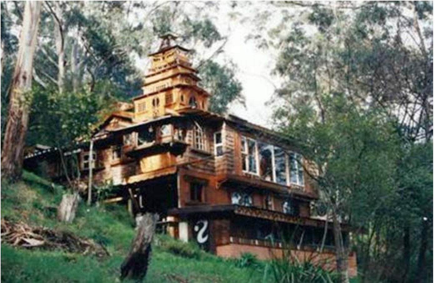
Figure 4. Boingaology Headquarters , 1982