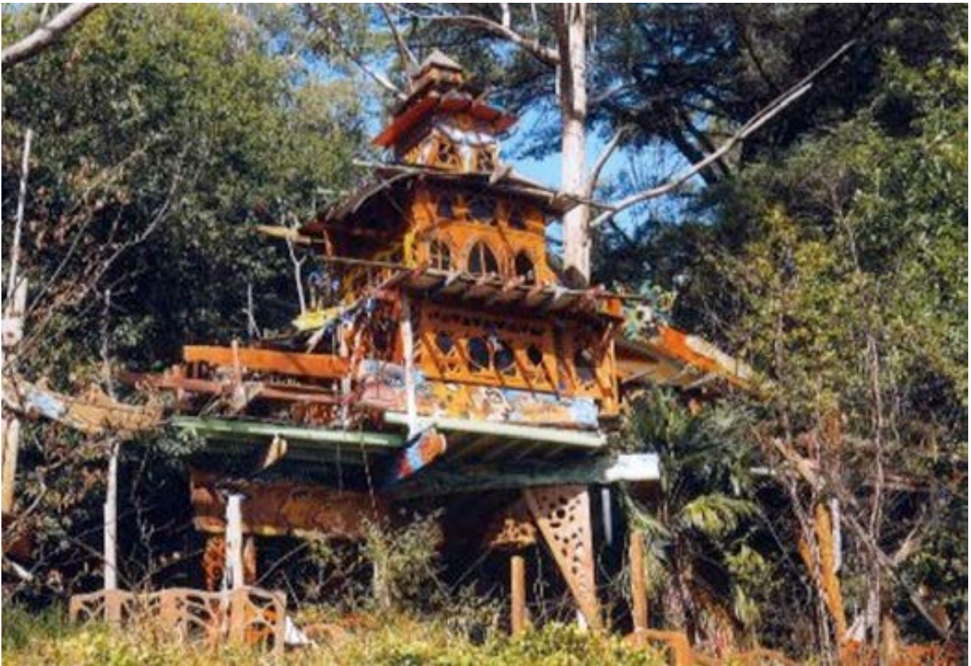
Figure 1. A view of the temple from the Warburton Highway, January 2001