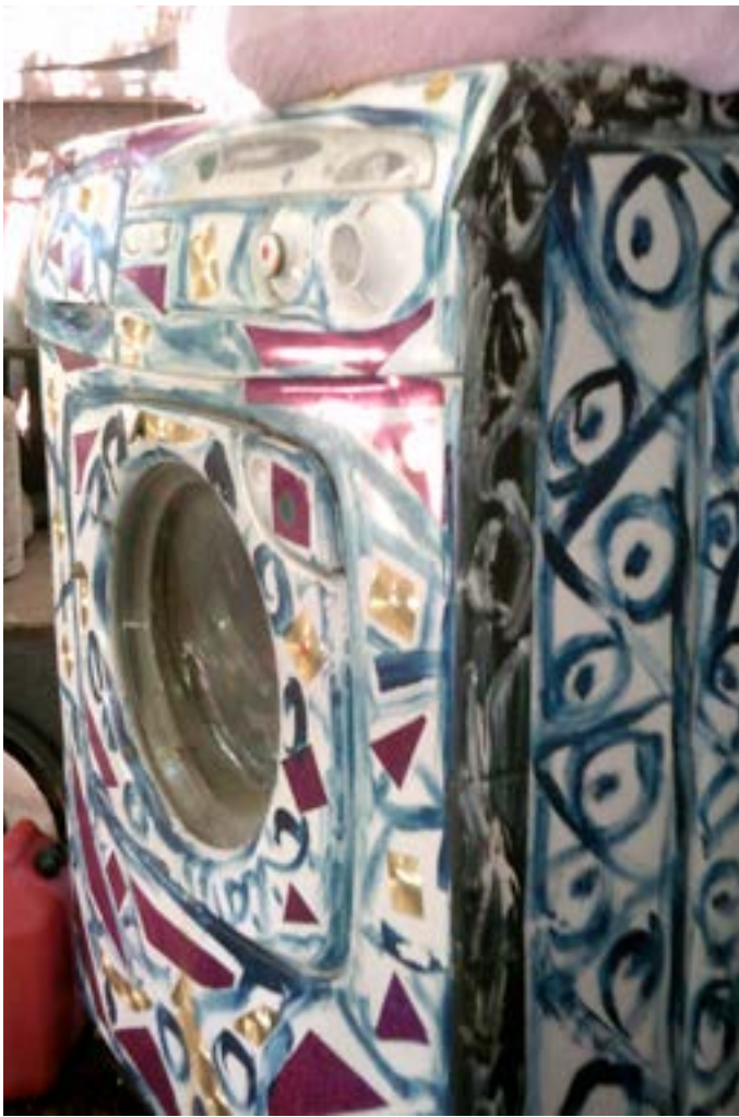
Figure 13. Painted washing machine, June 2012

The psychosexual component inherent in reclamation is perhaps more visible in Man Ray's depiction of a woman's body as a musical instrument and the painting of sound holes on her back. Man Ray called this work Violon d'Ingres , which in French is the term for a hobby or a captivating pastime. Like Oppenheim's Cannibal Feast it depicts the woman as an object of use. Man Ray's work is based on the neo-classical Baigneuse de Valpinçon ( The Valpinçon Bather , 1808) by Ingres which sits in the Louvre, Paris. 18 Ingres was known for his break with tradition and his radical expression of nature's fecundity manifest in his voluptuous nudes. Oppenheim's interpretation is, on the one hand an attack on classicism, tradition and the bourgeoisie and on the other it reminds the onlooker that Ingres was a violinist before he was a painter. 19 Taken together, woman and violin both get depicted as the objects of play, which speaks to the subjugation of women generally, as well as the primal fantasy that the Outsider artist taps into.