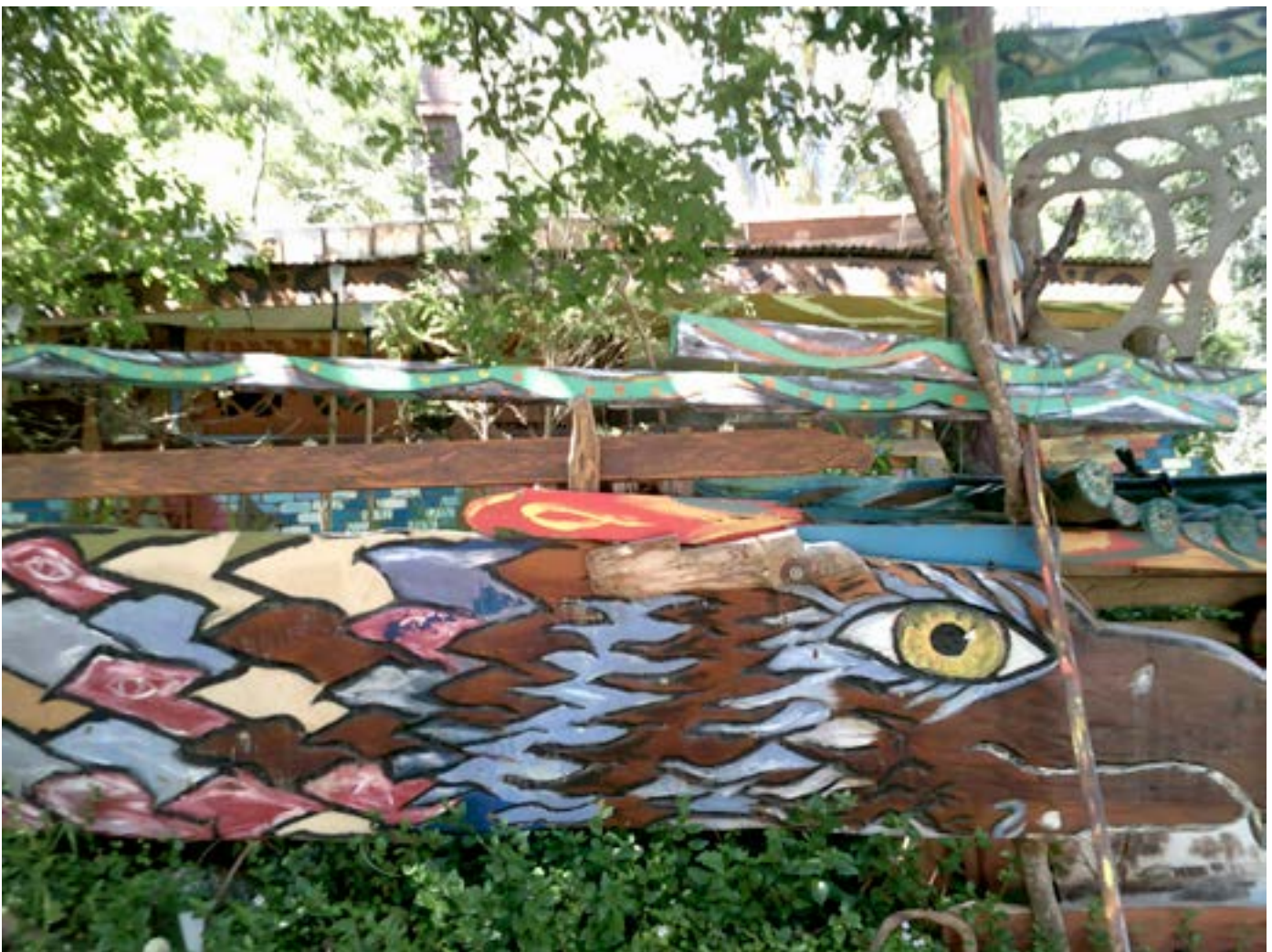
Figure 5. Eagle head fence post, November 2013

eagles. Their purpose is multi-dimensional; they hold up floors, decorate windows and provide perches for visiting wildlife. These totems extend the length of boundary fences and they climb the height of electricity power poles (figure 5).