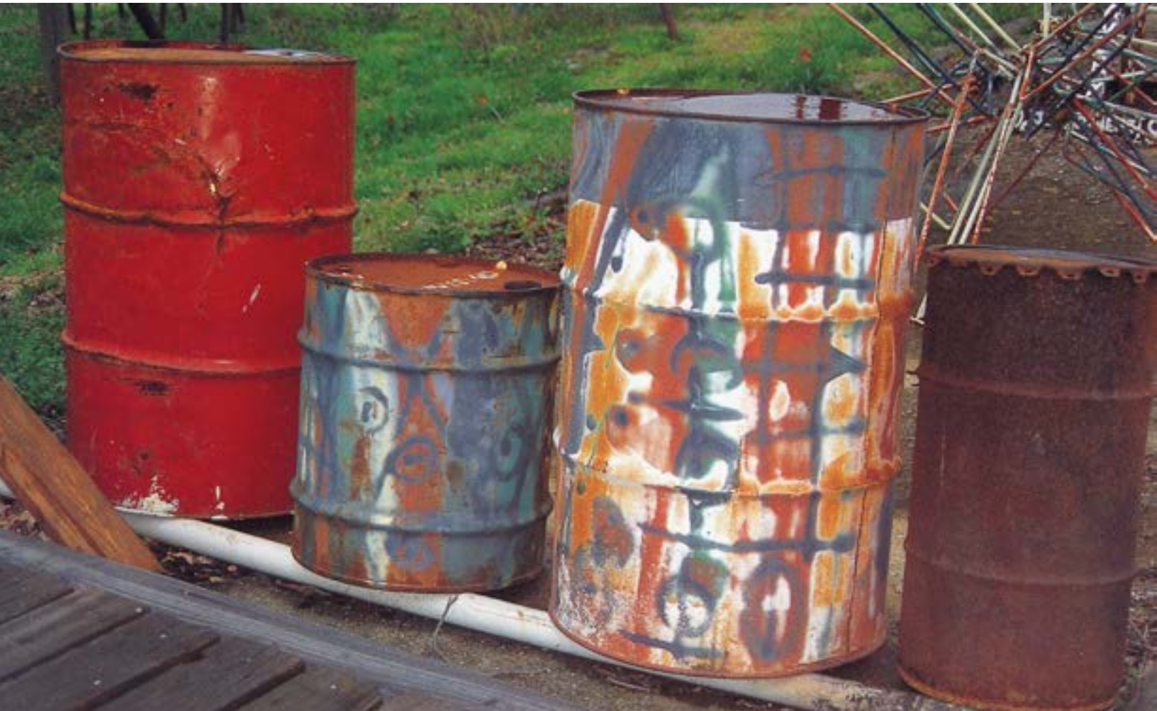
Previous pages: Figure 5. Joe Minter, 'Guard Warriors', African Village in America , Birmingham, Alabama (photograph Colin Rhodes, April 2012) Above: Figure 6. Joe Minter, Talking Drums , 1990, painted metal barrels (photograph William Arnett)